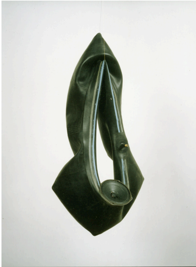
William Anastasi, Without Title [Sound Object] , 1964, inner tube, speaker,

The Museum of Contemporary Art decided to represent inter-media and sound art for the most part focusing on communicating ideas to the visitors. It's worth emphasizing that the labels explaining the works place them in a wider context. This is especially important in an exhibition of challenging art of this nature, which is both tremendously simple and highly complicated. In many ways the work is a kind of research in and for the artistic environment. There is a kind of research investigating aspects of work – what happens when it is exhibited and so on. It is a kind of art that sometimes - against its purpose- can make the audience feel dumber than it is, as though to say, “Look, we will help you to open your eyes to the poetry of everyday life and chance in a way that will enrich your trivial and blinkered views”. But perhaps, with the exception of Anastasi's cloth used in boiling brown rice, Cage, Anastasi and Bradshaw do not belong to this category because they always approach the world with simple but thought provoking, structuring actions which open us up to the already visible and change it - an art which may cause its audience to take time to reflect upon the existential questions.