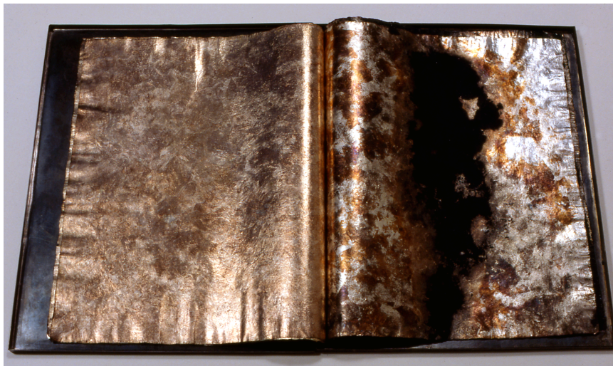
Dove Bradshaw, Contingency [Book] , 1996, silver, liver of sulfur on linen paper, 66 x 107 cm

Work as a process of change could be the title for the contribution by the younger Dove Bradshaw (born 1949). Anastasi and Bradshaw have prepared for the exhibition for a few months at the state's workshop at Gammel Dok. Bradshaw collected a series of faxe calkstones which she left for weeks on a much larger piece of kildecalk in the museum's garden. The disintegration process of the top stone created by rain and weather appear as beautiful patterns of a kind of limestone bleed onto the "understone". Now they are